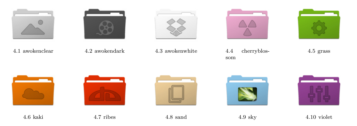
Figure 4: Sub-types of awoken folder icons

AwOken sub-types AwOken type is included from version 2.4. It includes AwOken folders, a new folder concept specifically designed for AwOken icon set. It's tought to cover some lacks derived from folders currently available, both in color and in style availability. Even if it's quite obvious, awokenclear, awokendark and awokenwhite colors were designed to match three default AwOken iconsets, namely AwOken, AwOkenDark and AwOkenWhite (for more informations, please check the official homepage). AwOken folders come with 10 different flavours: