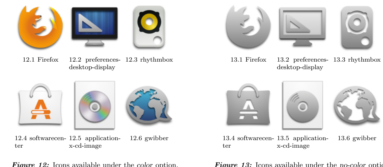
Figure 12: Icons available under the color option.

To give an idea of this features, here is a quick glance of the two options side-by-side: icons on the left are available under the color option, icons on the right are loval to the typical no-color option.