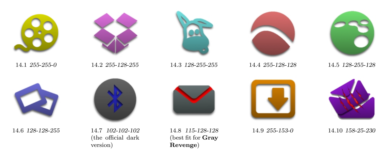
Figure 14: Example of colorized icons.

Here are some examples (with related \mathbf{R} - \mathbf{G} - \mathbf{B} codes):