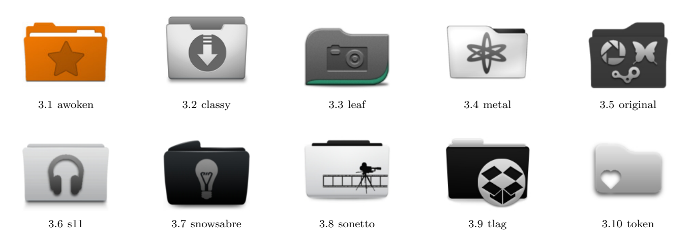
Figure 3: Macro-types of folder options

There are a lot of different folder types included in the iconset. Below, you can see 10 macro-types of folder options; note that images below are only examples: for each type there is a choice of 34 different icons wich you can use to customize some folders [for example folders in the home directory] and get a better look and feel. To get an idea, just go to the clear/128x128/places directory, and see them! From 1.6 version, you can see folder icons directly in the customization script, so you have not to go manually in the previous directory. Note that from 2.4 version the folder structure (ie types and subtypes) experienced a drastic redesign, to improve either the script and the iconset both from the point of view of the order and of the consistency.